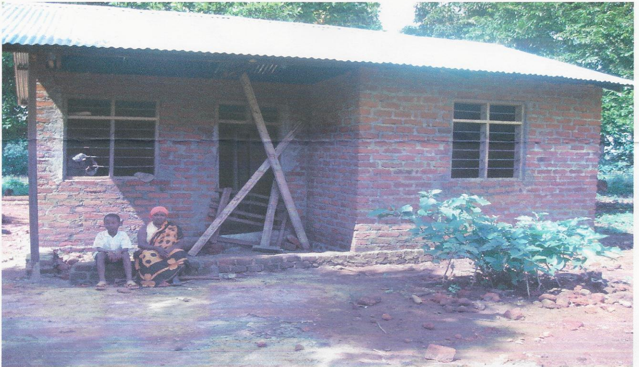
FRONT ELEVATION OF THE NEW HOUSE IN FINAL STAGE CONSTRUCTED BY THE MONEY YOU SENT TO THE PROJECT .ON THE PHOTO IS MGAYA AND HIS DISABLE GRANDMOTHER SITTING ON FOUNDATION FLOOR.