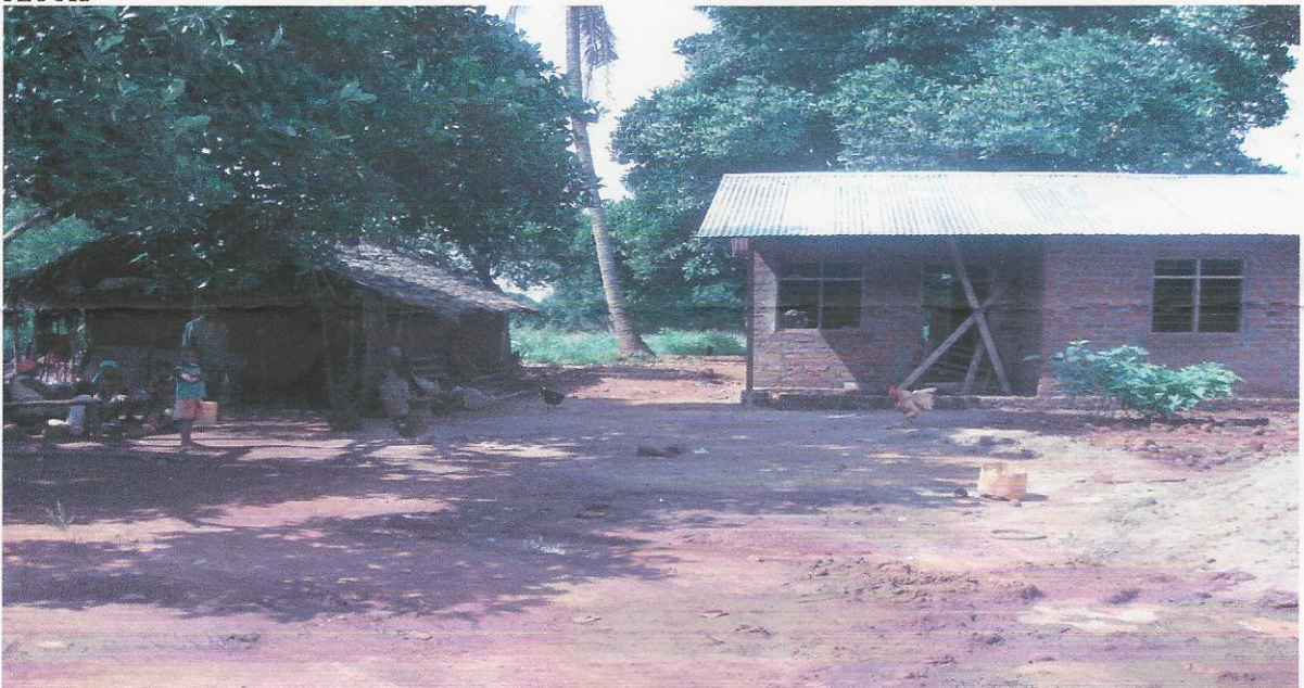
BEHIND FROM THE NEW HOUSE IS A PREVIOUS HABITAT/HOUSE OF TWO CHILDREN LIVING WITH THEIR GRANDMOTHER .